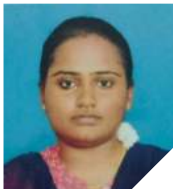
Suganya Department: CRM