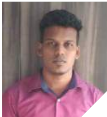
Migavel Department: Purchase